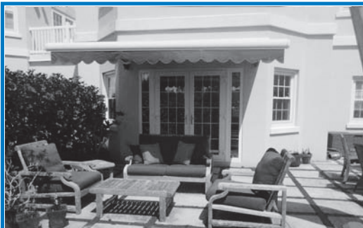
#14 STRAWBERRY HILL, PAGET

2 Bedroom, 2 bathroom condo in great condition with pool and tennis court.