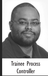
Trainee Process Controller