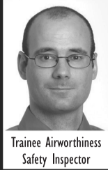
Trainee Airworthiness Safety Inspector